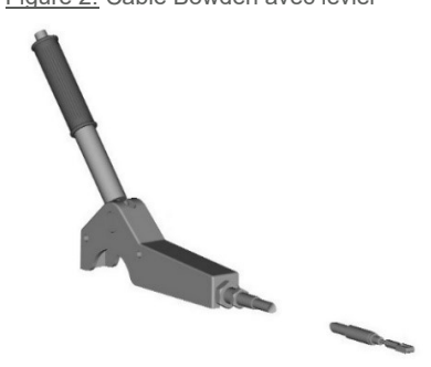
Figure 2: Câble Bowden avec levier