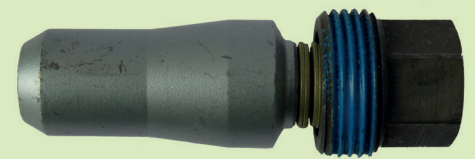
Clamp cone bolt ring version 1 3/4" 65.12.11 / 108493