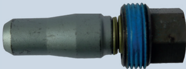
Clamp cone bolt 1 3/8" 65.12.06 / 107540