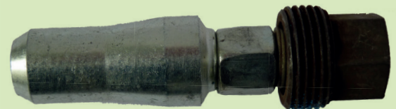
Clamp cone bolt 2 1/4" 65.12.13 / 158202